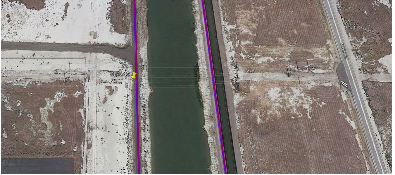
2) Location map